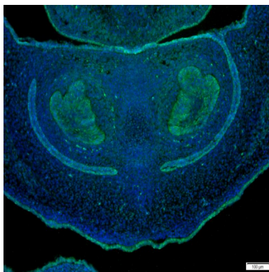
Immunofluorescence analysis of YAP1 in mouse embryo using YAP1 antibody.