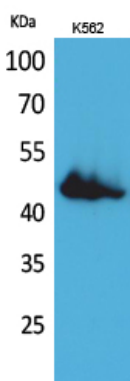
Western Blot analysis of K562 cells using CD177 Polyclonal Antibody.. Secondary antibody was diluted at 1:20000