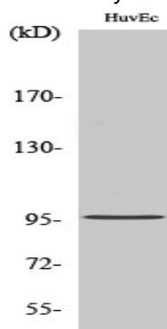
Western Blot analysis of various cells using Cdc27 Polyclonal Antibody

Western blot analysis of lysates from HUVEC, HepG2, and COLO205 cells, using H-NUC Antibody. The lane on the right is blocked with the synthesized peptide.