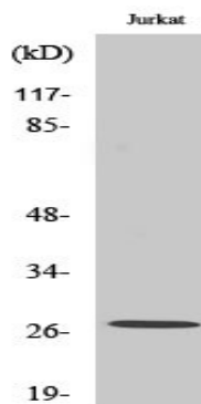
Western blot analysis of NGF in Jurkat lysates using NGF antibody.